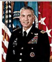
COMMANDER GEN Paul M. Nakasone, USA